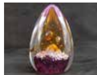
Amethyst & Gold