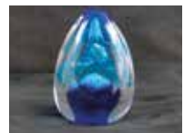
Sapphire & Turquoise