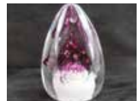
Amethyst & White